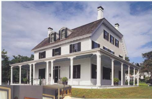
The Alice Brayton House, Green Animals

The Preservation Society of Newport County