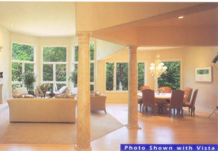
Photo Shown with Vista

In addition to providing a more comfortable environment by cutting glare and heat, the product has an enormous benefit for clients with art collections. The need to reduce fading is a given, and we have found the product exemplary in protecting art pieces where light damage is a concern.