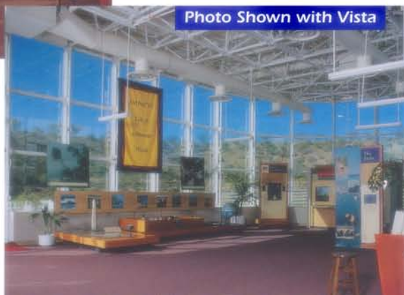
Photo Shown with Vista